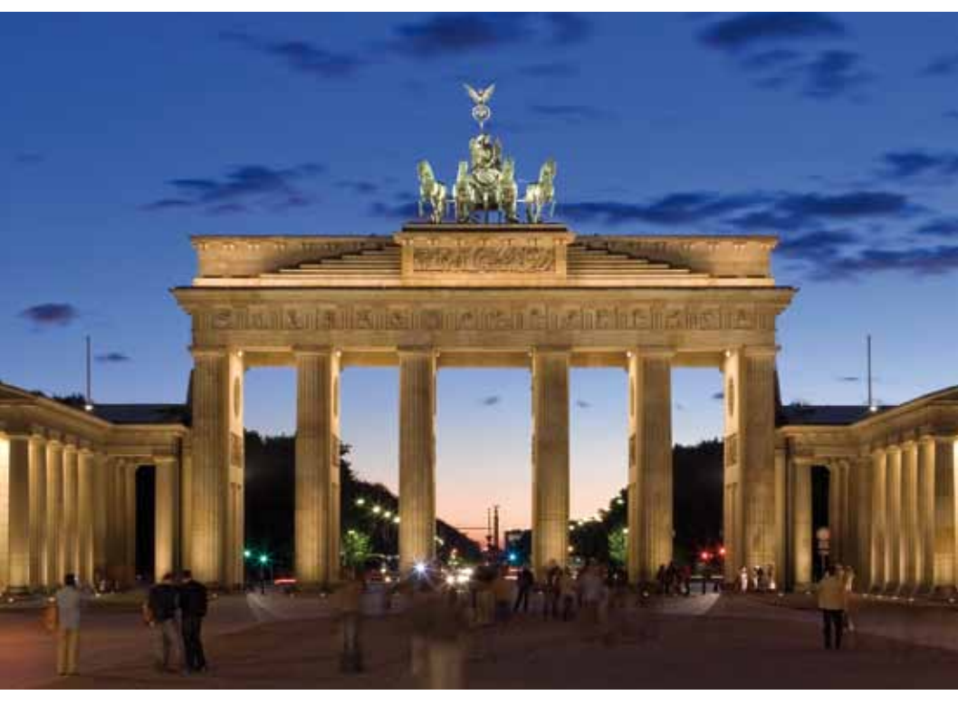
The Brandenburg Gate is one of Berlin's most important monuments – a landmark and symbol all in one.