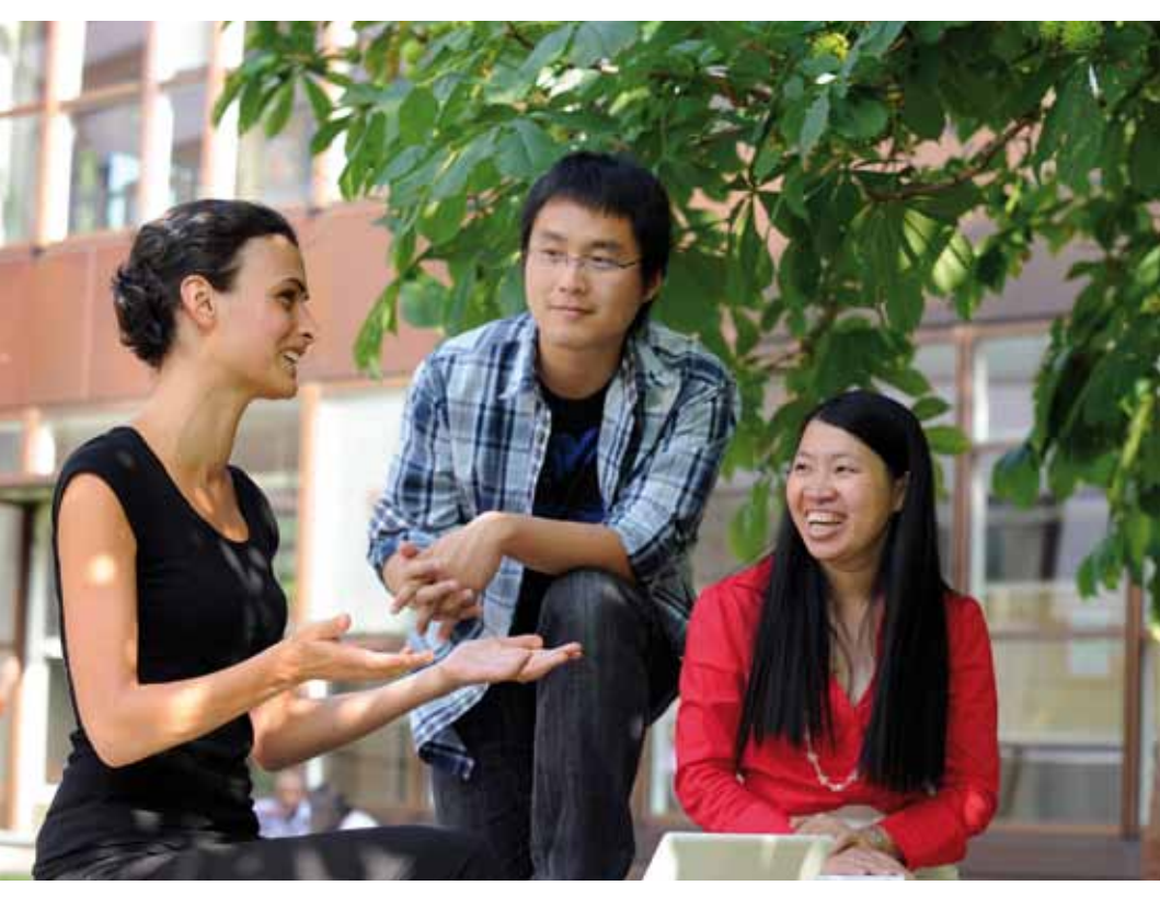
Roughly 28,500 young people study at Freie Universität Berlin.