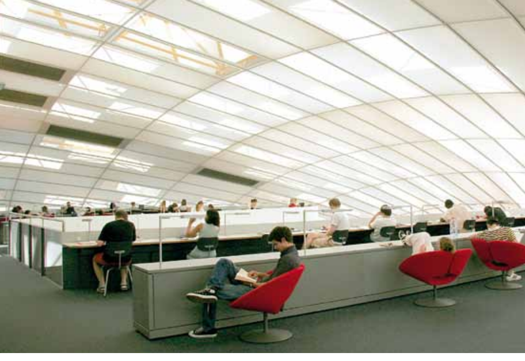
Designed by architect Lord Norman Foster, the library building has been the recipient of many awards.