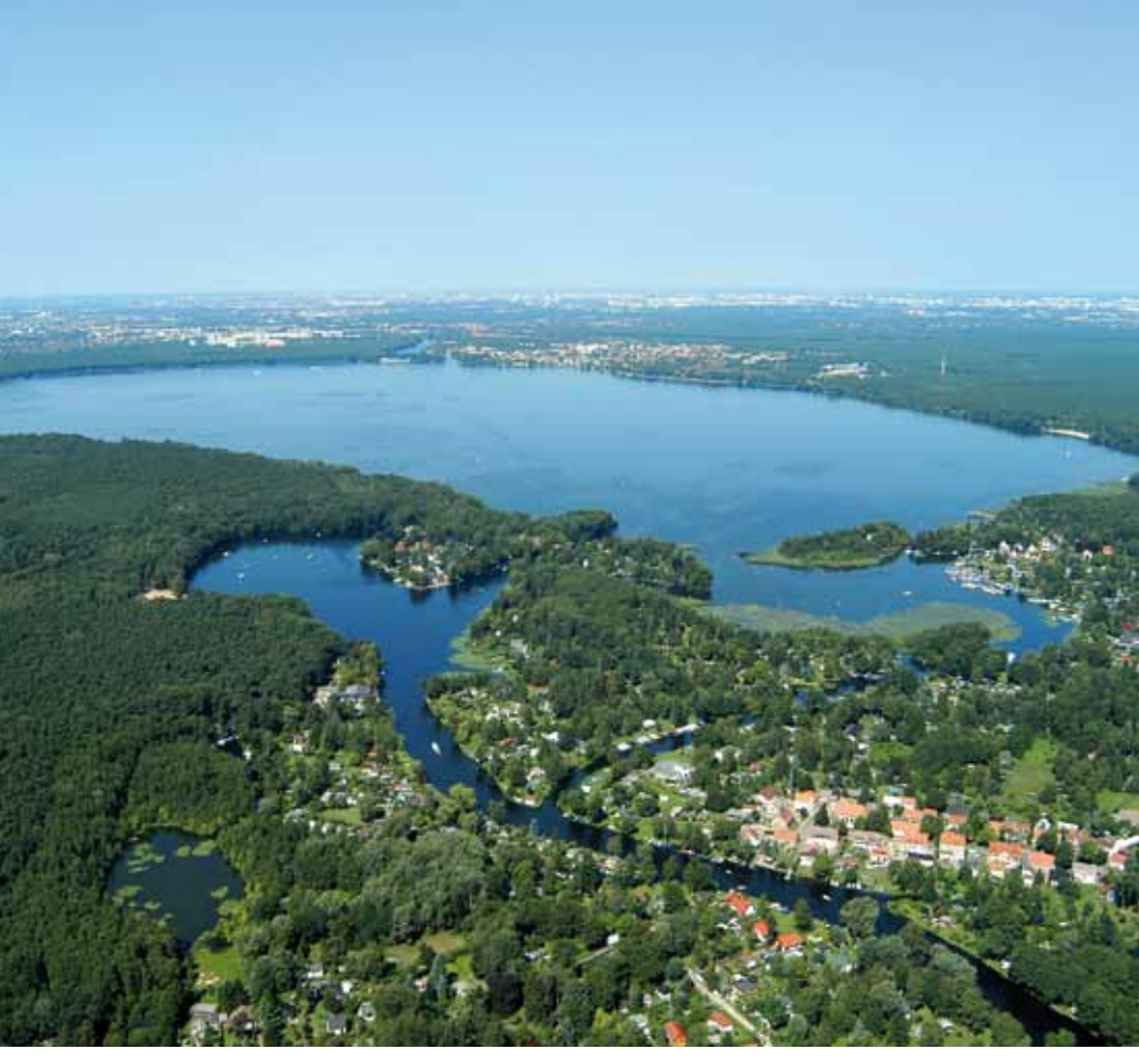
Berlin's great wealth of urban green space helps provide a high quality of life.