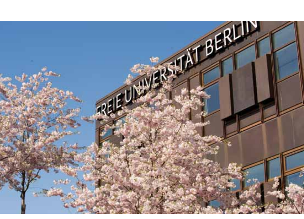
According to the prestigious journal Times Higher Education Freie Universität places above all the other German universities in the humanities.