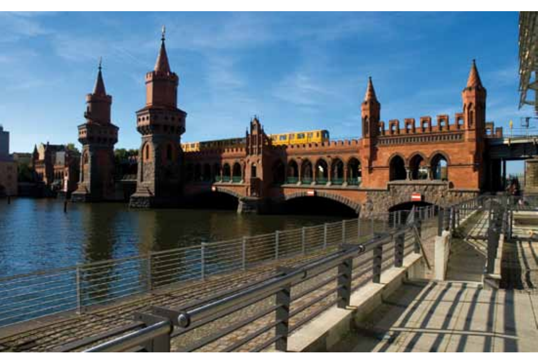
An easy way to get around is to use the extensive public transportation system.