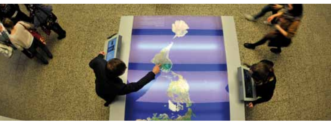
People from 125 countries are involved in undergraduate and graduate study and teaching activities.