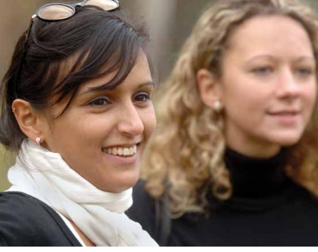
According to statistics from the German Academic Exchange Service (DAAD), Freie Universität is by far the most popular destination in Germany for students from abroad.