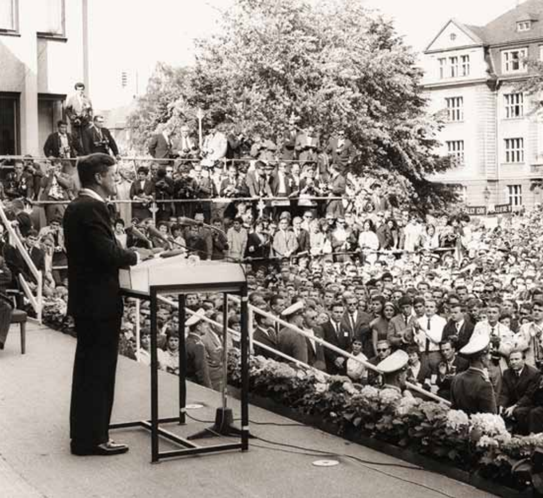
In 1963, U.S. President John F. Kennedy held a speech at Freie Universität Berlin.